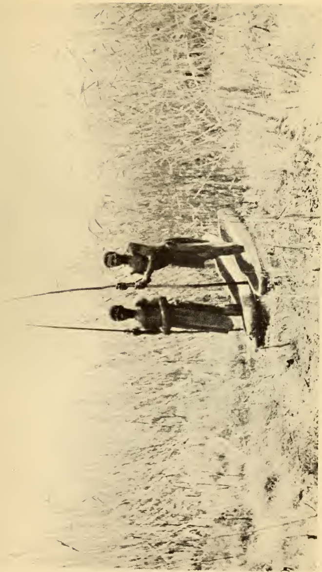
ON THE ZAMBESI Natives pushing their canoes through the reeds.